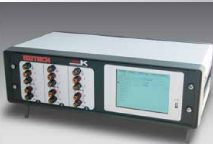
Unequalled combination of accuracy, stability and versatility.

"Performance by Design" was the mantra and passion behind the development of the microK. On Day 1 a decision was made, "no tweak pots" (such as used on AC Bridges to correct for flux leakage), no software adjustment, no "self-calibration" but performance by design. The microK achieves its resistance ratio accuracy by design, not adjustment and is uniquely drift free.