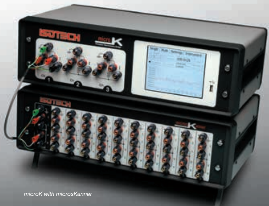
microK with microsKanner