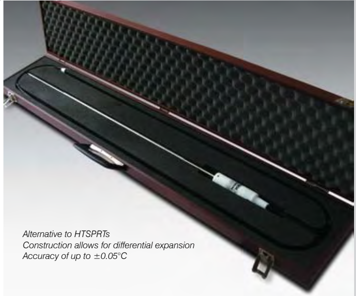
Alternative to HTSPRTs Construction allows for differential expansion Accuracy of up to ±0.05°C